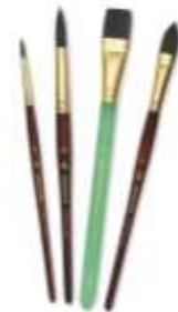
Silver Black Velvets

PALETTE My favorite palette is the The Robert E. Wood Palette