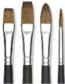
Blick Kolinsky & Red Sable Brushes